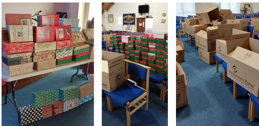
Perry Beeches Baptist Church collecting shoe boxes and packaging for distribution centre

Perry Beeches Baptist Church is proud to partner with Samaritan's Purse and support this project, which is the world's largest Christmas project of its kind. The church is also a distribution centre and receives shoe boxes from other churches and organisations on behalf of Samaritan's Purse. A total of 197 shoe boxes were produced.